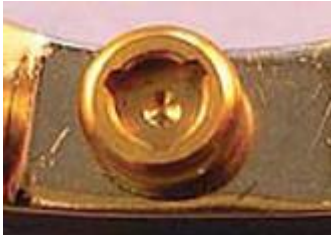
Drill & Tap

You have three (3) LOCATOR Attachment choices: