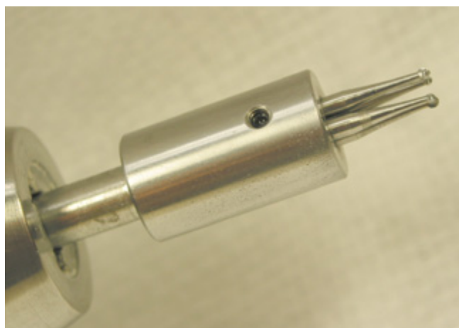
Adding creativity and realism to your service!